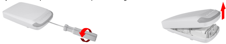
Figure 2: Removing the Top Cover